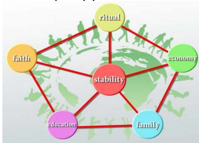
Figure 2. Philosophy and social science workers promote innovation

Adhering to the guidance of Marxism is the fundamental sign that contemporary Chinese philosophy and social science are different from other philosophical and social sciences. Marxism is a scientific truth that has been verified by history and reality. It still has a strong vitality. Upholding Marxism in philosophy and social sciences is related to what kind of worldview and methodological issues the philosophy and social sciences adhere to, and it is related to the fundamental and principled issues of human service in philosophy and social science research.